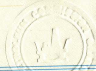
Chief Executive Officer Petroleum Commission, Ghana

Dated this day April 02, 2014 and valid until April 01, 2015